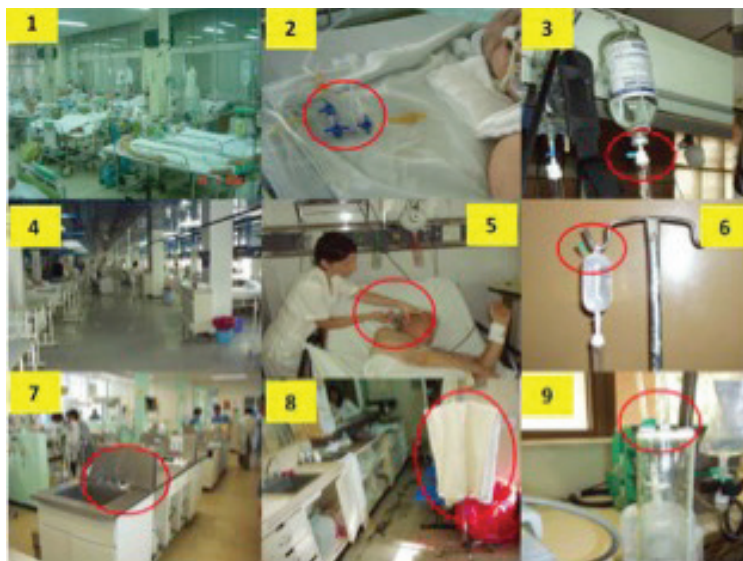
Figure 1: Limited resource intensive care units (ICUs) with outdated technology

Disclosure: INICC received a Grant from BD in order to research the scientific literature for this bundle.